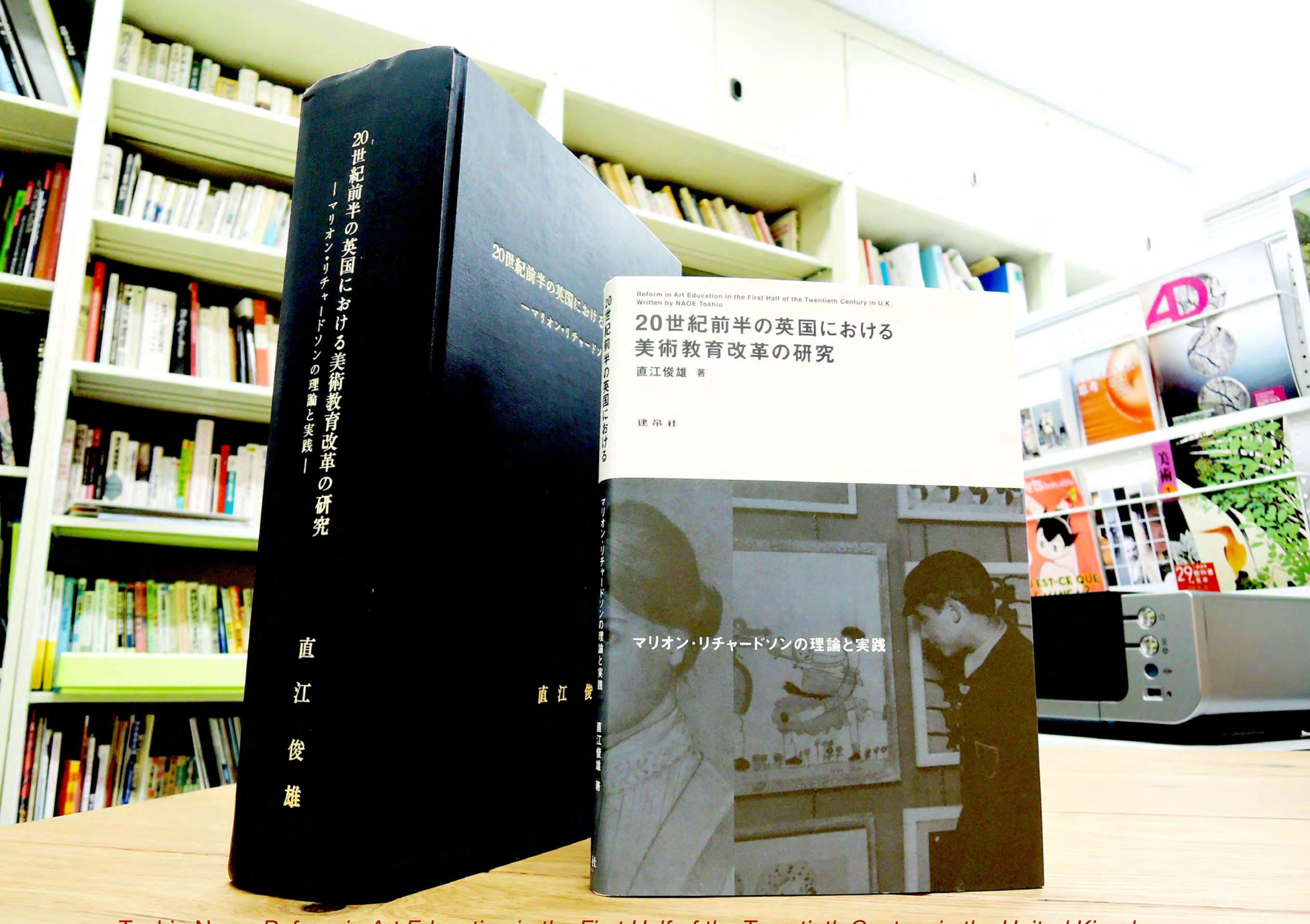
Toshio Naoe, Reform in Art Education in the First Half of the Twentieth Century in the United Kingdom: Theory and Practice of Marion Richardson, 2000, 2002.